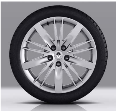
17" Celsium alloy wheels