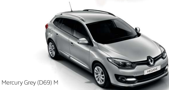
Mercury Grey (D69) M