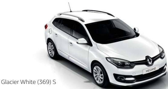
Glacier White (369) S