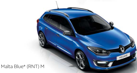
Malta Blue* (RNT) M