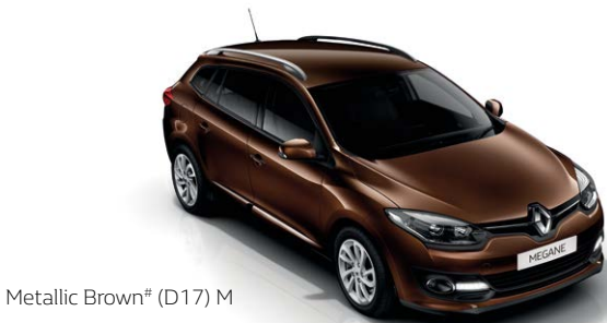
Metallic Brown# (D17) M