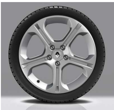
18" Serdard alloy wheels