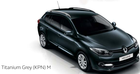
Titanium Grey (KPN) M