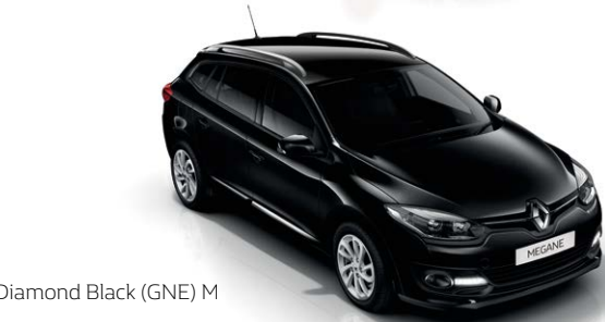
Diamond Black (GNE) M