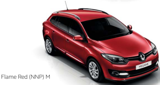
Flame Red (NNP) M