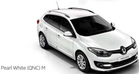
Pearl White (QNC) M