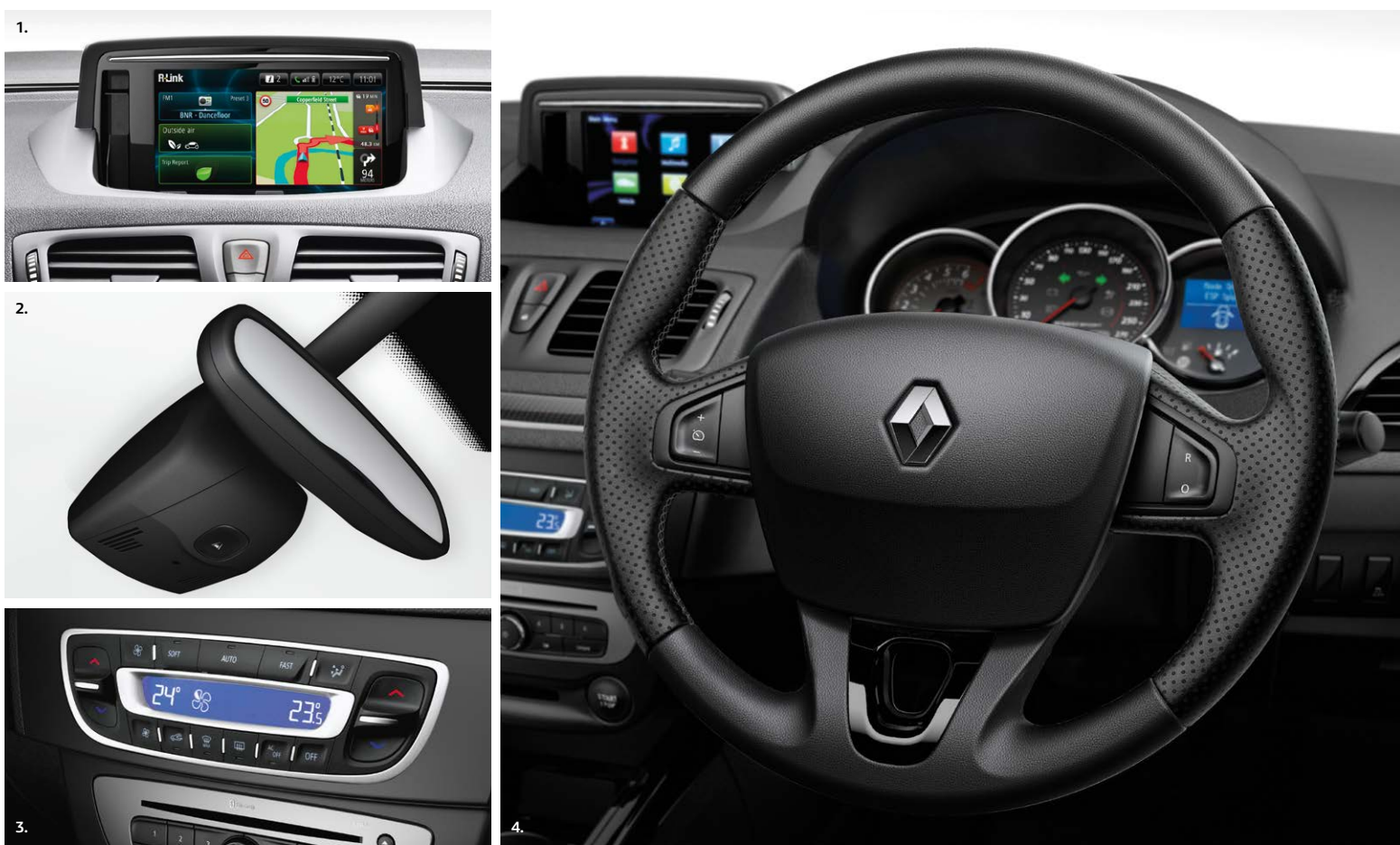
1. R-Link Enhanced Satellite Navigation with central console~ 2. Visio System (Lane Departure Warning & automatic high and low beam)* 3. Dual zone climate control 4. Leather wrapped steering wheel