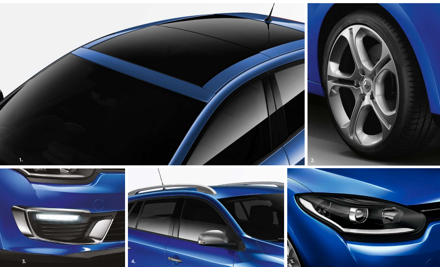
1. Electric panoramic sunroof* 2 Alloy wheels^ 3. LED daytime running lights 4. Satin grey highlights 5. Automatic dusk sensing headlights^